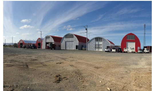
Figure 2: Omu Project Core Yard

Cautionary Statement and Forward Looking Statement Disclaimer: Certain information included in this discussion may constitute forward-looking statements. These statements involve known and unknown risks, uncertainties and other factors that may cause actual results or events to differ materially from those anticipated in such forward-looking statements. Such statements are based on a number of assumptions which may prove to be incorrect. Investors should not place undue reliance on forward-looking statements as the plans, intentions or expectations upon which they are based might not occur. The Company cautions that the foregoing list of important factors is not exhaustive. Investors and others who base themselves on the Company's forward-looking statements should carefully consider the above factors as well as the ability of obtaining sufficient financial support.