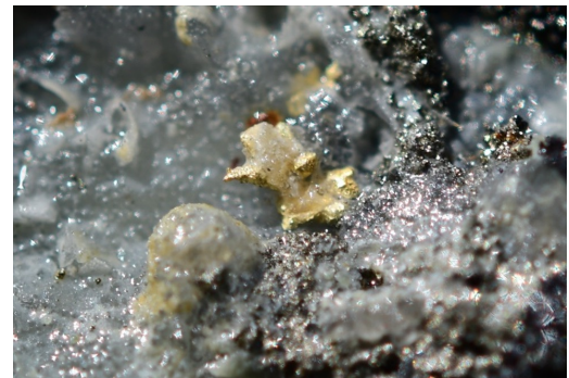
Figure 3: Visible gold from Yamagano